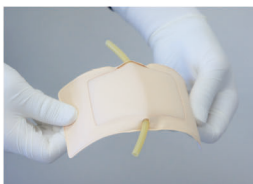
* Fits a variety of body types!!