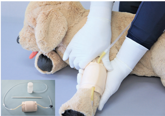
* Z100 main unit

A blood collection and injection trainer for veterinary professionals is now available!