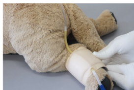
* When fitted to the lateral saphenous vein.