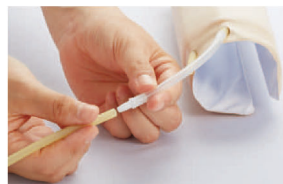
* Two types are available, with blood vessel sizes of 1.8 mm and 3 mm.