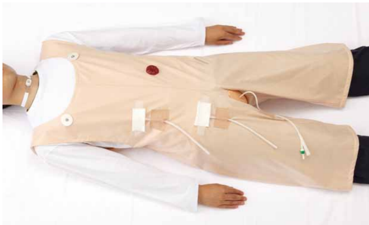
* Various drainage tubes, catheters, or adhesive tapes are not included.

Practicing postoperative care using a naked model is awkward. To cope with such an opinion from the scenes of nursing practice, the postoperative care suit, which can be worn over regular clothes, was developed. The body of the suit, which is waterproof, has holes for abdominal and thoracic drainage, and is packaged with suture seals, a stoma, electrodes, a tracheal cannula, and male and female external genitalia. Various types of postoperative care can be practiced.