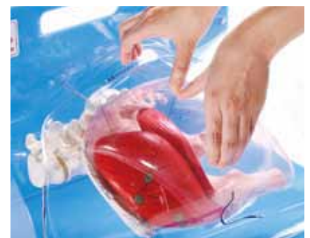
Shibusanbu method (Upper Outer quadrant of the Buttocks)