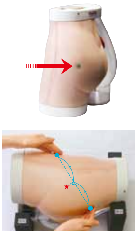
Posterior superior iliac spine - great trochanter