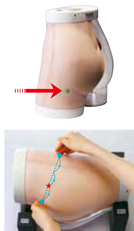
Ischial tuberosity - great trochanter