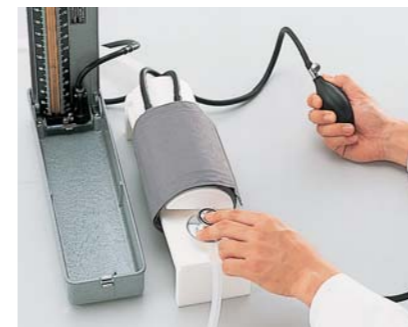
Light, Compact and Easy to Use!