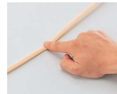
Excellent kits how to measure blood pressure.