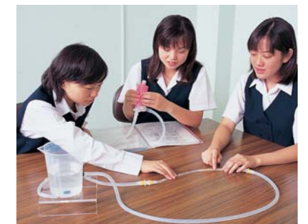
As group study is available, this enable to have clear understanding by discussion whenever questions arise through experiment.