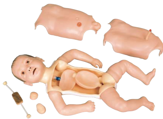
4 weeks baby

Boy and girl can be changed by exchanging abdominal cover.