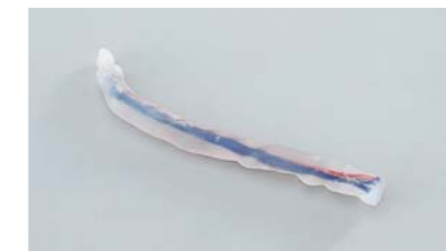
Umbilical cord (fit-on & off available)