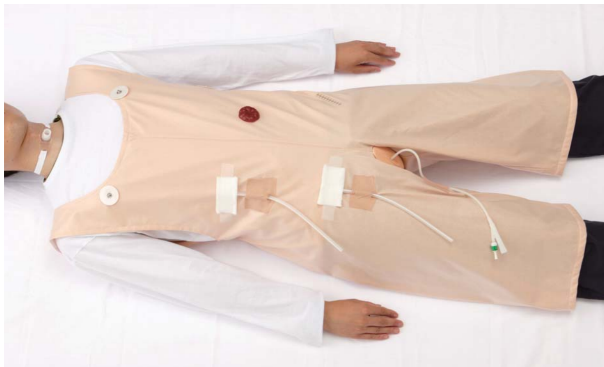
* Various drainage tubes, catheters, or adhesive tapes are not included.

Practicing postoperative care using a naked model is awkward. To cope with such an opinion from the scenes of nursing practice, the postoperative care suit, which can be worn over regular clothes, was developed. The body of the suit, which is waterproof, has holes for abdominal and thoracic drainage, and is packaged with suture seals, a stoma, electrodes, a tracheal cannula, and male and female external genitalia. Various types of postoperative care can be practiced.