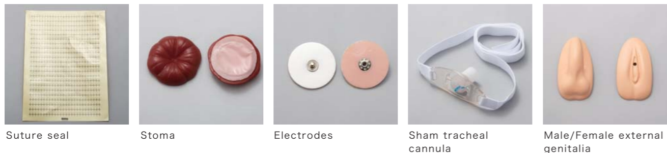
Suture seal Stoma Electrodes Sham tracheal cannula Male/Female external genitalia